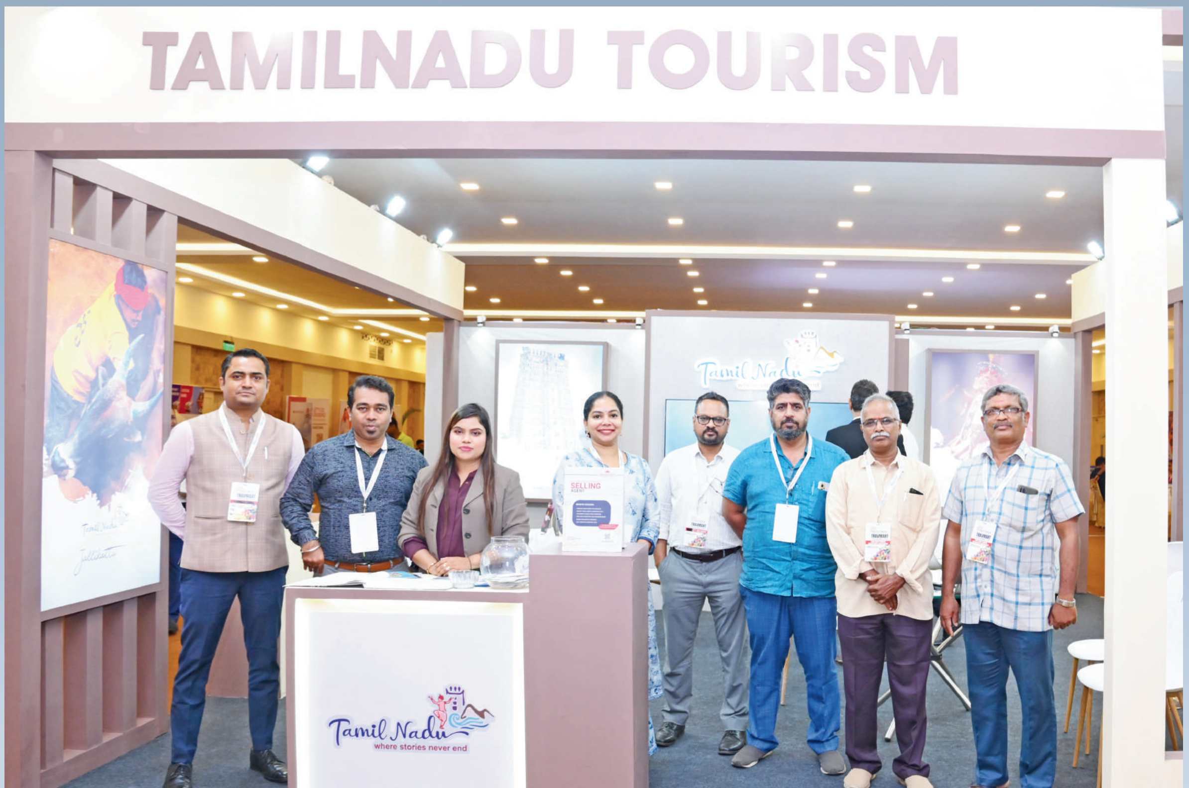
36 sq m Booth